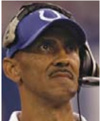
Tony Dungy Coach and Mentor

This year's Superbowl was especially delightful for the tens of thousands of fans in Tampa where I live-- Coach Tony Dungy won! We had suffered when he was fired from the Bucs, but thousands of us have continued praying for him. We thrilled at his winning seasons with the Colts, and now this Ultimate Win. Pages of newsprint grew about the Christian testimony of the